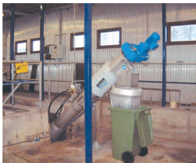
ROTAMAT® Micro Strainer Ro 9 size 700 installed in the channel