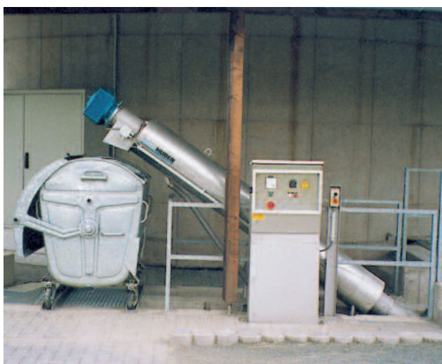
Outdoor installation of a ROTAMAT® Micro Strainer Ro 9