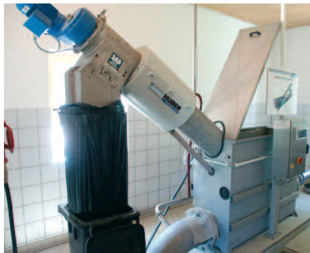
Tank installation of a ROTAMAT® Micro Strainer Ro 9