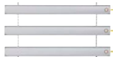
Module TYPE G

"Efficiency and aging analysis about AEROSTRIP® presented to a conference of Japan Sewage Works Association in year 2012 revealed 38% less power usage compared to ceramic type diffusers, while OTE and strength of membrane remained virtually unchanged after 10 years operation. Several treatment plants continued running longer than 10 years without any replacement. We think that AEROSTRIP® has a great future, due to the high OTE demands in Japan."