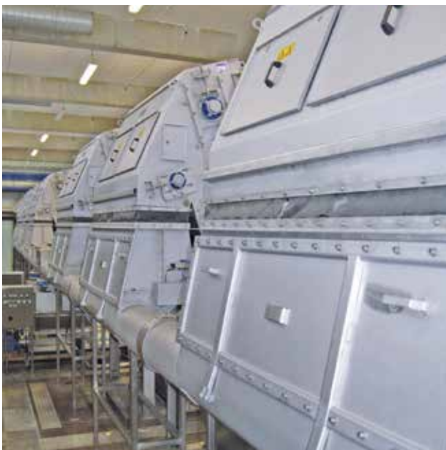
Rear view of the HUBER Belt Screen EscaMax® with subsequent launder channel for wear-free screenings transport.