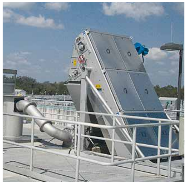
Fully enclosed, odour-free HUBER Belt Screen EscaMax® with easy to remove covers.