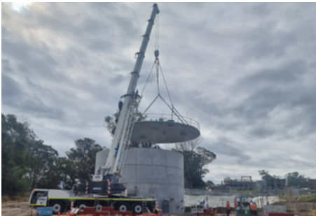
West Camden STP, NSW