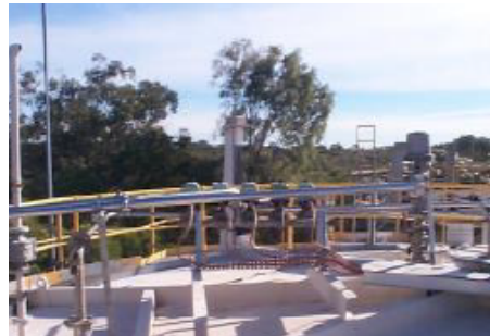
Luggage Pt STP, QLD