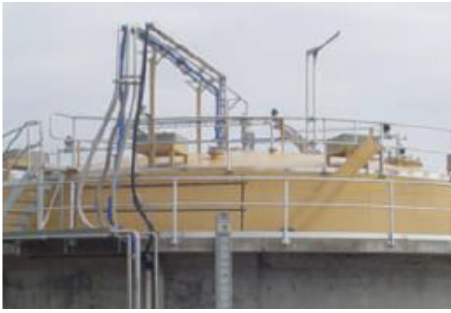
Cessnock WWTP, NSW