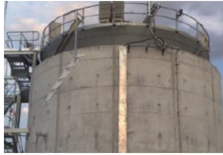
Bird in Hand, SA