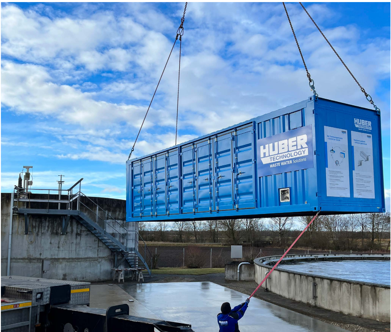
Simple dryer installation thanks to the containerised design.